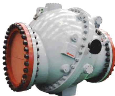
Premier's Multi Door Check Valve