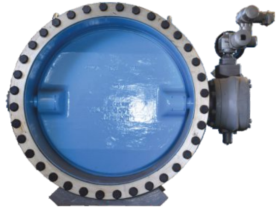
Gunric Triple Eccentric Metal Seated Butterfly Valve

Gunric Valves, manufactured by Zenzele Valves Manufacturing (ZVM), includes triple eccentric butterfly valves, tilting disc check valves and dampers. The triple eccentric butterfly valves incorporate tri-centric sealing geometry and the laminated stainless steel or solid metal seal of the this valve provides bubble tight shut-off within a wide range of temperatures and pressures.