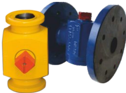
CEM Cock Valves