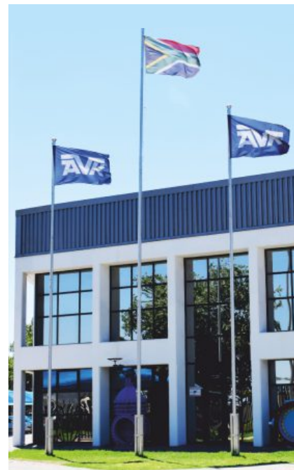
AVK Southern Africa head office, located in Alrode, Gauteng.

Home to a modern corporate office, dedicated distribution centre and professional in-house training facility that supports skills transfer programs, AVK SA's Water, Industrial and Projects Divisions ensure the distribution, installation, commissioning and refurbishment of its own brands. These brands include Premier Valves, Gunric Valves, Industrial Petroleum Valves (IPV), Baker Control Valves and Cementation Engineering (CEM).