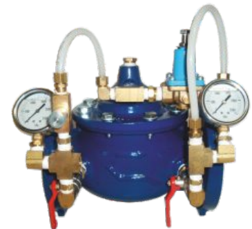
Baker Control Valve

The Baker Control Valve has played a significant role in the water and mining industries since 1975. For more than 40 years they have offered a technical competitive advantage to the market by providing a 4:1 pressure reduction ratio as opposed to a 3:1 ratio. The Baker is also capable of operating at low pressures, improving the life span and maintenance of the valve and consequently reducing costs.