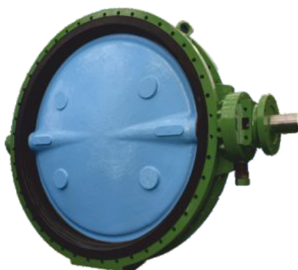
Premier's Butterfly Valve

Premier Valves products are manufactured by PVE (Premier Valves Engineering) and have been supplied in South Africa for more than 50 years. This includes three core valve types for the water industry all developed to suit South Africa's operating conditions such as metal seated wedge gates, resilient sealing eccentric design and rubber lined concentric design butterfly valves and multi-door reflux valves.